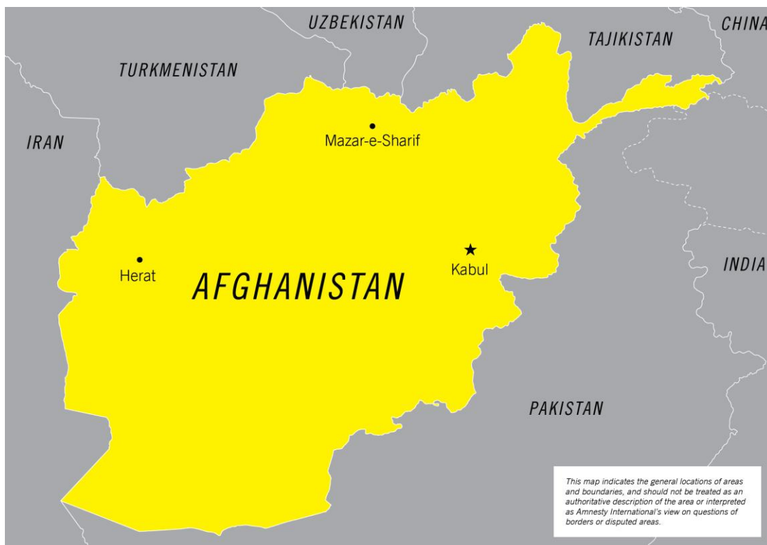
Map of Afghanistan, with the Herat, Kabul and Mazar-e-Sharif marked – the towns visited by Amnesty International for this report.