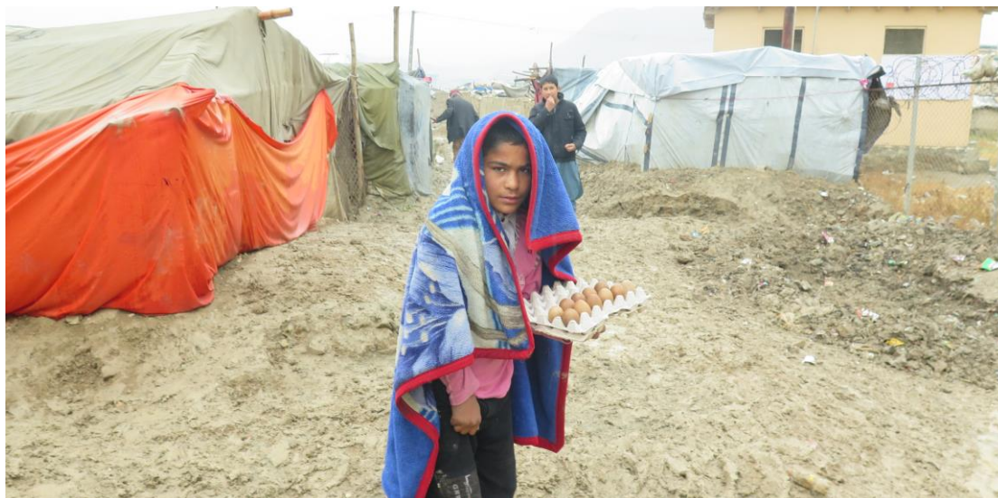
A 15-year-old boy in Kabul selling eggs at the local market to make a living. November 2015 © Amnesty International.

building townships and roads, which is the mandate of other ministries. According to MoF officials, the MoRR failed to submit credible proposals for meeting the needs of displaced people in the 2016 budget because of “low capacity” and because “there is no mention of IDPs in [the MoRR’s] budget request”. 95