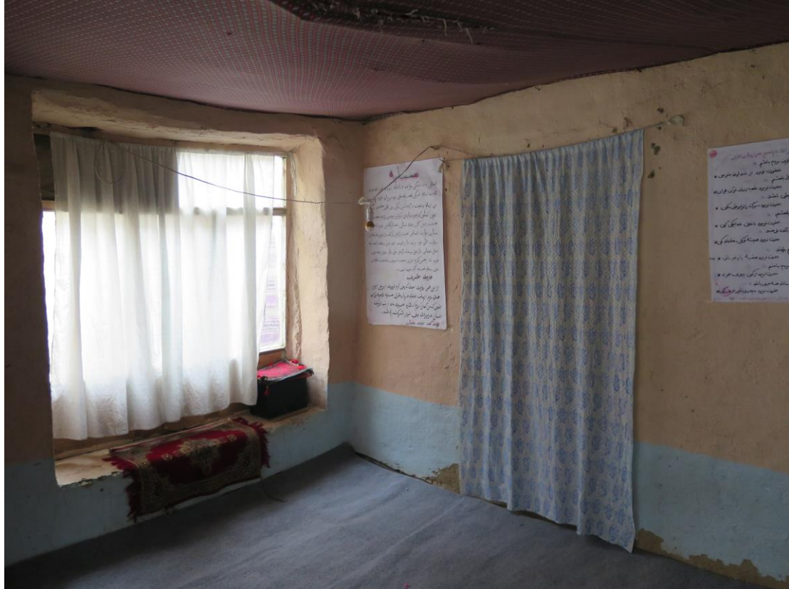
A room used as a classroom for displaced children in Chaman-e-Babrak settlement in Kabul, November 2015

There is also much recent evidence that displaced women and girls find it particularly difficult to access education. A comprehensive 2014 study by the NRC and The Liaison Office found that young displaced women and girls are often forbidden from leaving their homes by male relatives, making attending school—extremely difficult. The isolationism facing women and girls contributed to a sense of desperation and hopelessness, with the study reporting serious mental trauma among interviewees. 218