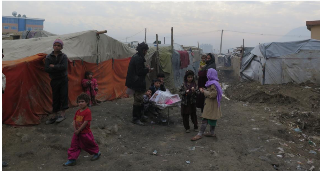
Residents of Chaman-e-Babrak settlement in Kabul, November 2015

The final policy, officially the National Policy on IDPs in Afghanistan, was endorsed at a meeting of the Council of Ministers on 25 November 2013 and launched by the Afghan government on 11 February 2014.