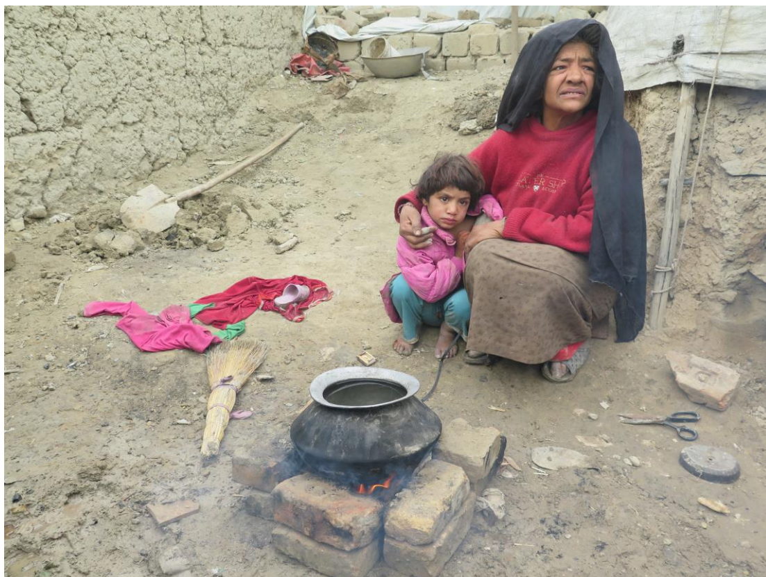
A displaced woman with her daughter in Kabul, November 2015