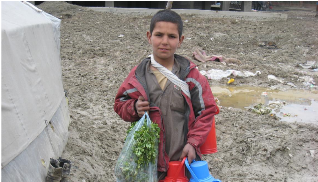
A 14-year-old boy in Charrahi Qambar settlement in Kabul, November 2015

Additionally, public hospitals only provide vaccinations and contraceptives free of charge, while other medicines must be bought from private clinics or pharmacies. While affording medicines is a struggle for many Afghans, it can be particularly difficult for displaced people who lack regular incomes and are often economically worse off than other urban poor (see more in section 4.5: Employment). Some displaced people reported having debts of several thousand Afs at private hospitals or pharmacies to buy medicines which they could not afford to pay back. One 55-year-old man in Naderabad camp in Mazar-e-Sharif said: