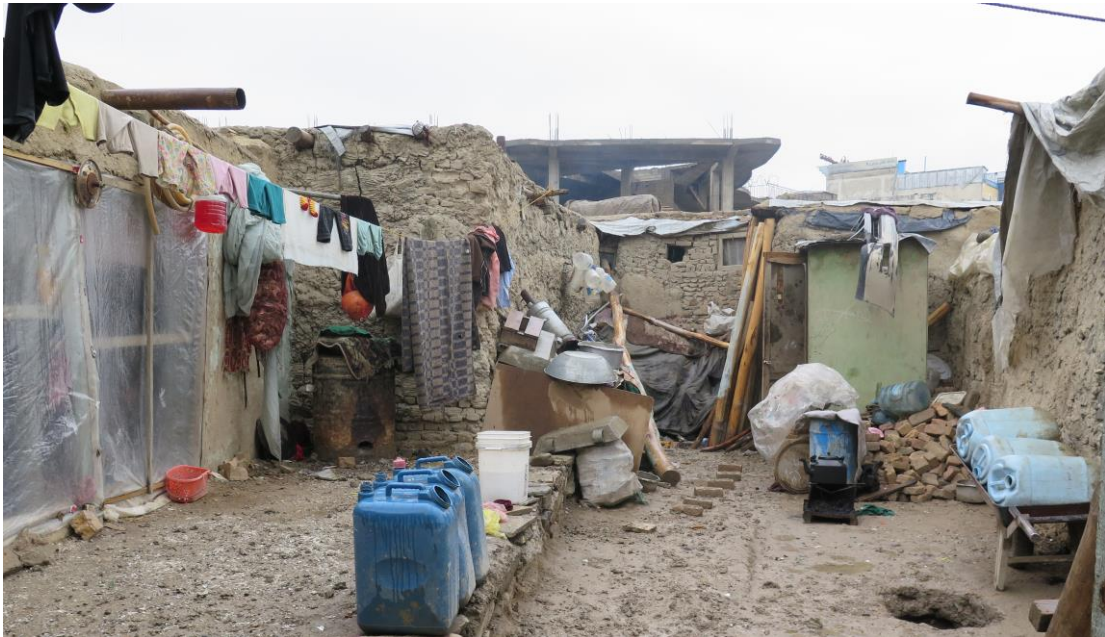
Chaman-e-Babrak settlement, Kabul, November 2015

Past attempts to allocate government land to displaced people or returnees in Afghanistan, as stipulated in Presidential Decree 104 (December 2005), have been largely ineffective and riddled with corruption. 131 The land has often been barren or unfit for agriculture and too far away from services and employment opportunities. 132